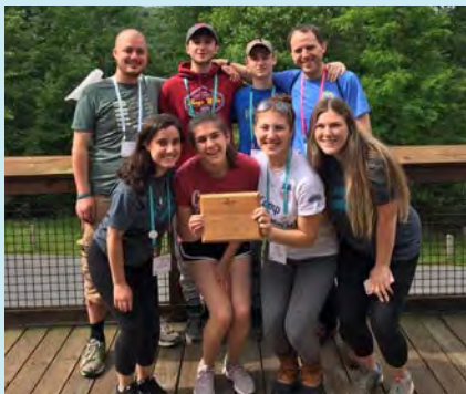
Receiving their plaque at the end of the seminar.

It has been almost a decade now that Laurelwood has taken part in a North America camp staff fellowship program known as Cornerstone. Sponsored by the Foundation of Jewish Camp (FJC), the Cornerstone Fellowship offers returning staff a way to; connect with others (from more than 60 Jewish Camps) who are passionate about Jewish camp, develop skills to make a positive, innovative impact on our community, exchange ideas, attend workshops, trainings and immersive experiences while creating programs and activities for campers at their respective camps. Over the last 16 years, 3,600+ fellows have participated in this transformative leadership experience.